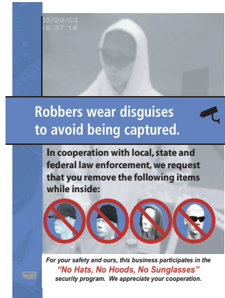
Counter Sign 8 1/2" x 11"