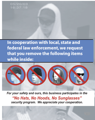
Door Static Sticker 8 1/2" x 11"